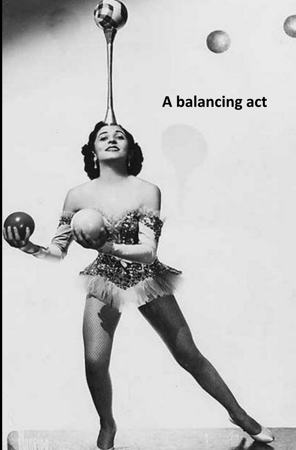
A balancing act